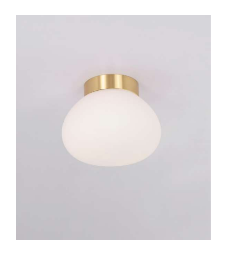
Wall or ceiling mounting